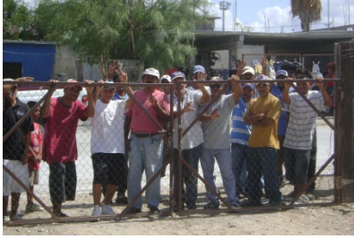
Men waiting in line for work opportunities at the Dispensa