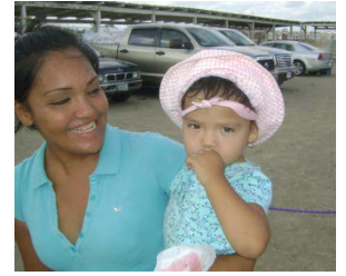
The young moms in the colonia inspire the Mission Volunteers.