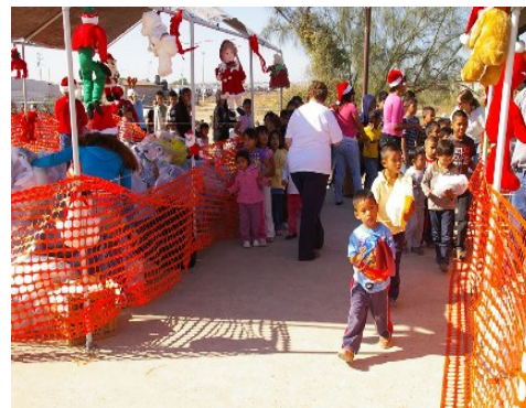
Christmas 2010 Toy Distribution