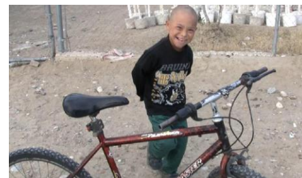
Bicycle for Christmas