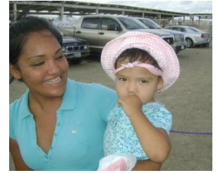
Strollers are of great need in the colonia.