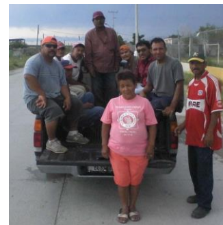
August Local Work Crew

The people we serve are grateful that we do return every other month. The children and their parents are so thankful for the school supplies and the school uniforms they receive as part of the sponsorship program. They are also thankful for the despensa and baby items